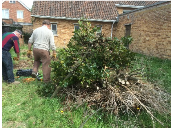
Getting a bit of exercise on the disused allotment at the rear of the URC