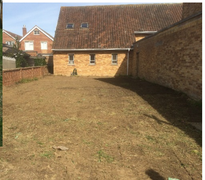
After we had cleared the site we arranged for a digger to level it