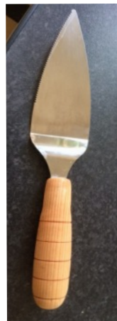
(Left) Alan used his woodturning skills to replace the broken plastic handle on this cake knife, resulting in another donation to Shed funds.